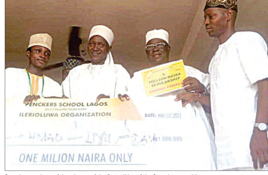
Organizers and one of the winners of the first edition of the Quranic competition.

The first category is for those in the age bracket of 10 to 15 and their area of concentration will Naas while the second category is for those between age 16 and 20 as they will be tested base on their