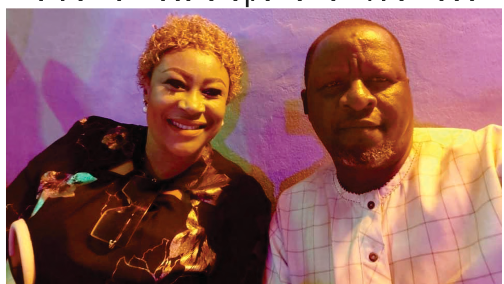
Hon. Grace Okere and Hon. Kehinde Bamigbetan